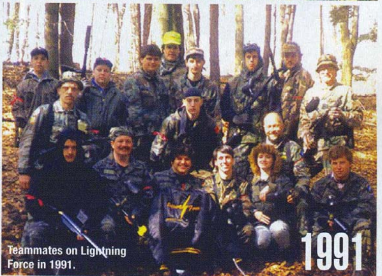
Teammates on Lightning Force in 1991.