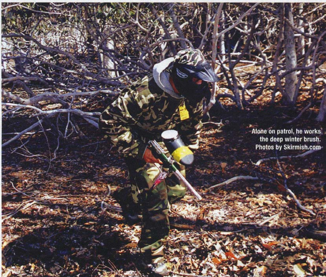
Alone on patrol, he works the deep winter brush.

In the 1990s, Lightning Force was a club with about 40 members. They would play every other Sunday on private property. While this was fun, a few members liked to always play in tournaments. They went to events at Skirmish USA in Pennsylvania, and to the