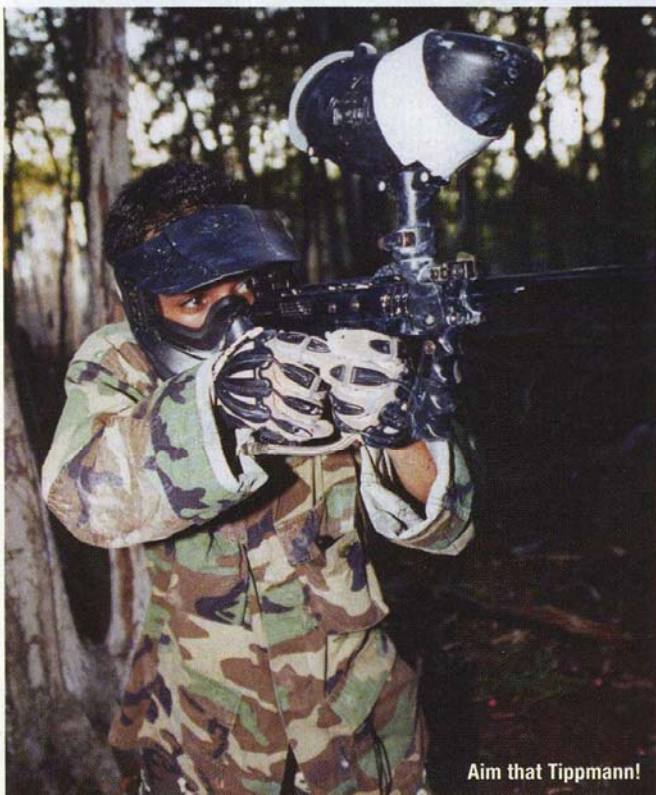
Aim that Tippmann!